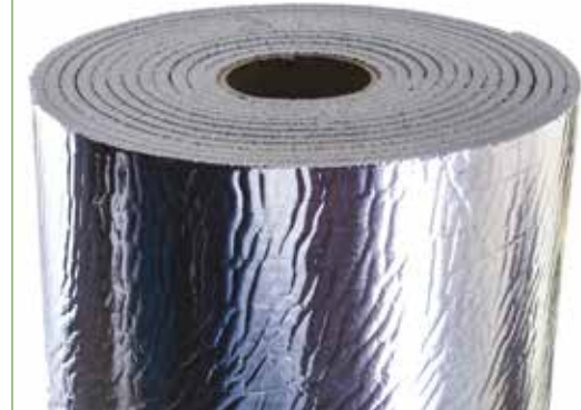
TROCELLEN CL 1 ALU SMOOTH